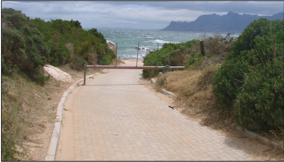
Figure 4: Boom at entrance to the Rooiels Slipway