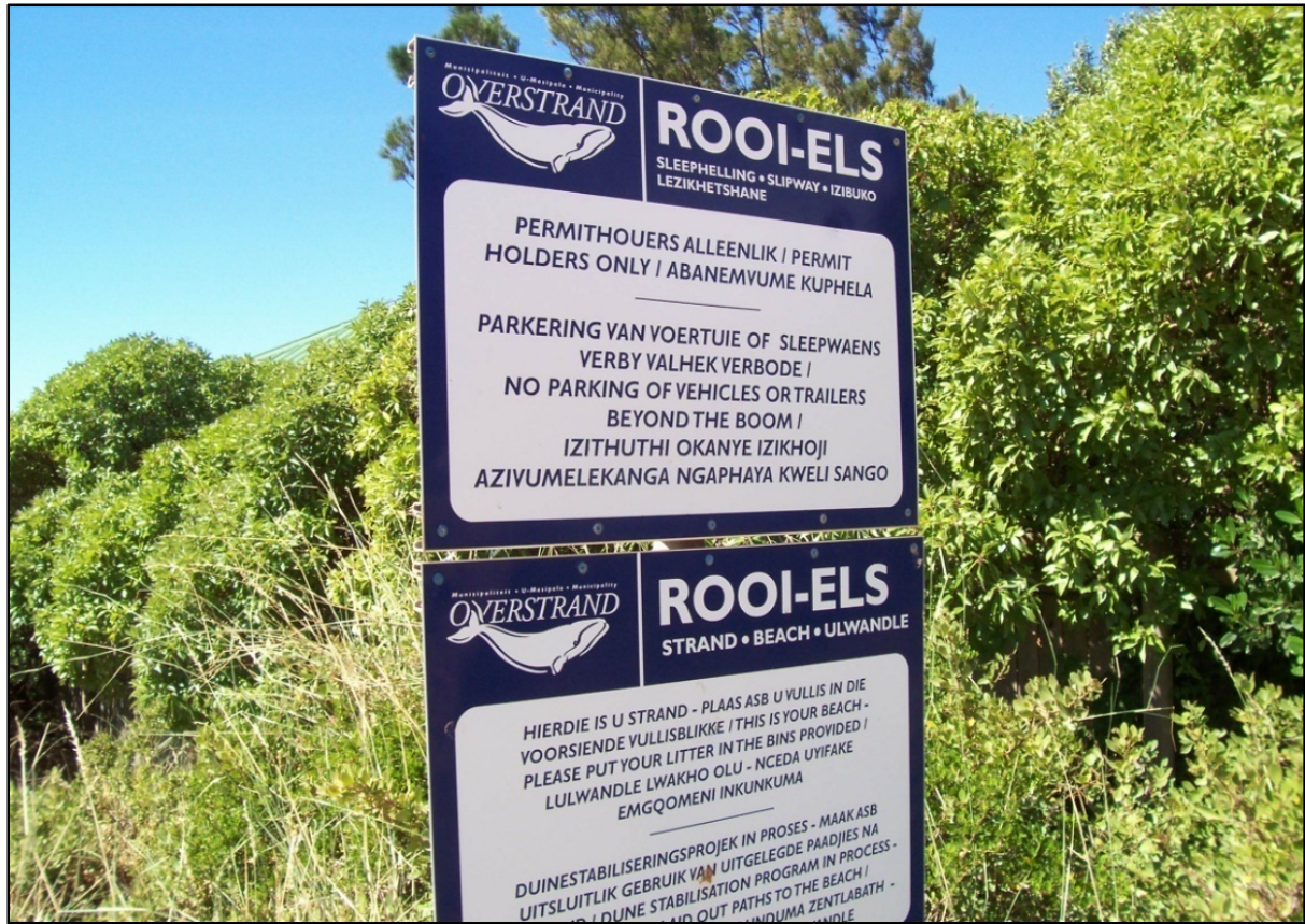
Figure 2: Sign at entrance to the Rooiels Boat Club Launch Site.