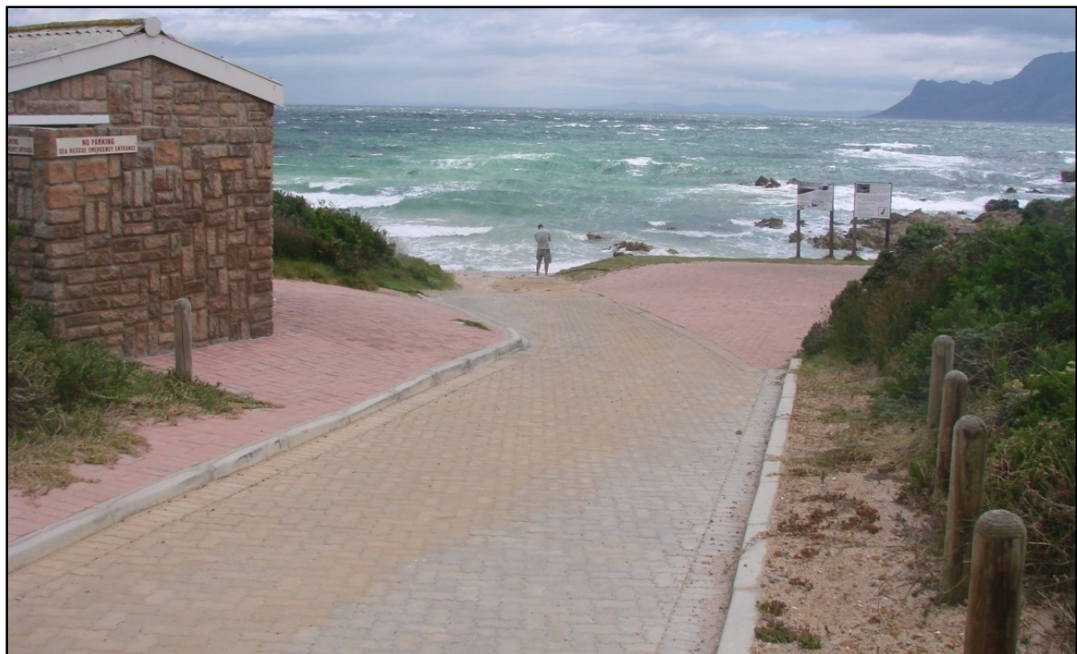
Figure 3: Access road and parking area