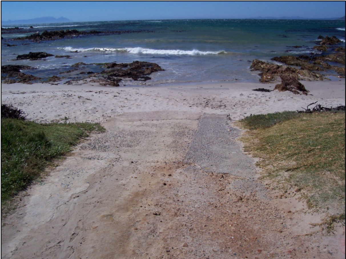
Figure 1: Rooiels slipway

Ensure that the relevant signs are erected before renewing the license and conduct regular inspections requesting copies of the launch register. Set a limit for the number of boats that may be launched here per day.